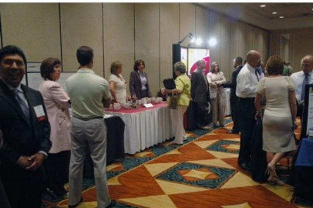
TMDA/TGS had 24 exhibitors at this years event.